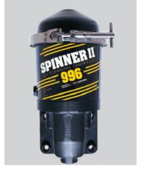
Model 996LCB - 7.5 litres per minute